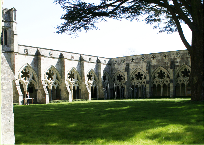
The cloisters, Salisbury Cathedral

Let every Christian pray, this day, and every day, come, Holy Spirit, come! Was not the church we love commissioned from above? Come, Holy Spirit, come!