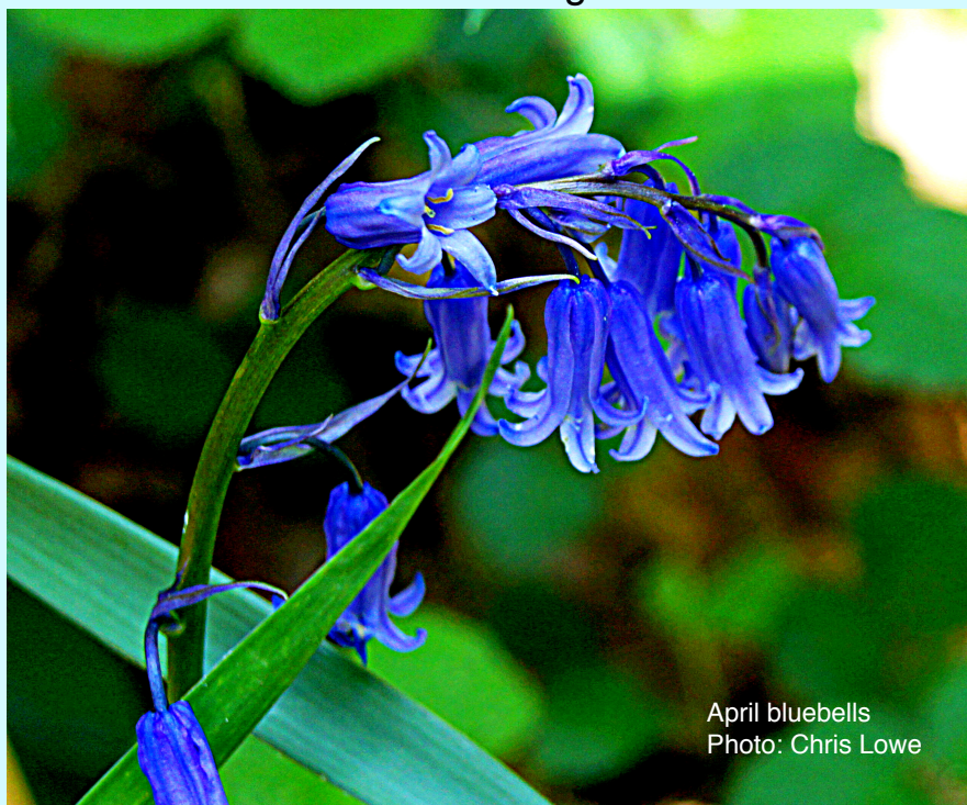
April bluebells

News and views for the Methodist Churches in Leighton Buzzard, Eaton Bray and Edlesborough