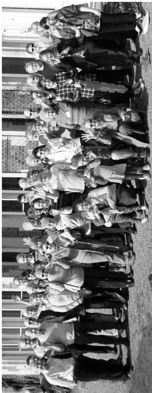
The happy group who enjoyed the weekend away at High Leigh.